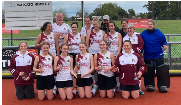
Reserve 2 Championship Round Ngaruawahia