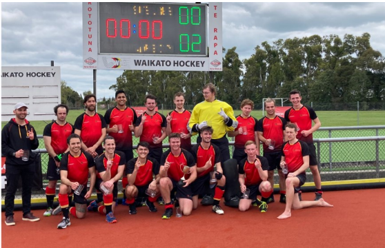
Reserve 2 Championship Round University Prem Dev