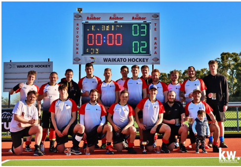
Mens Premier Championship Round University Storage King