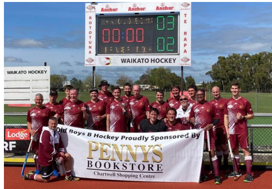
Reserve 3 Championship Round Hamilton Old Boys Penny's Bookstore