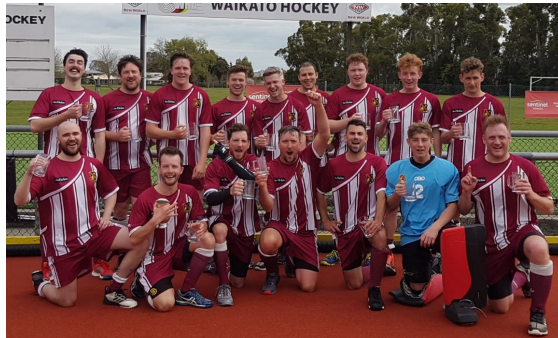
Reserve 1 Championship Round Hamilton Old Boys The Helm