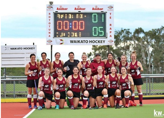
Womens Premier Championship Round Hamilton Old Girls AP Group