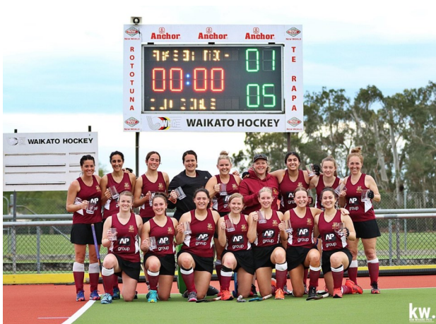
Womens Premier Championship Round — Overall — AP Group HOG