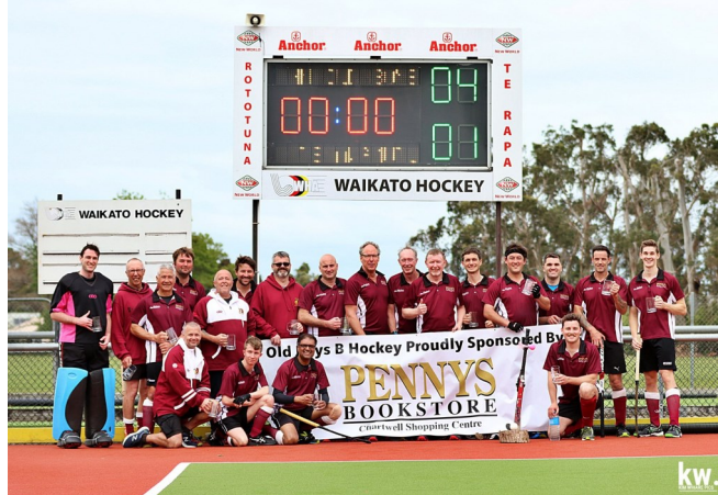
Reserve 3 Championship Round — Penny's Bookstore Old Boys