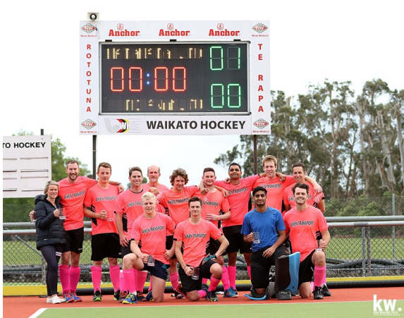
Reserve 2 Championship Round — UMS Mens Hockey