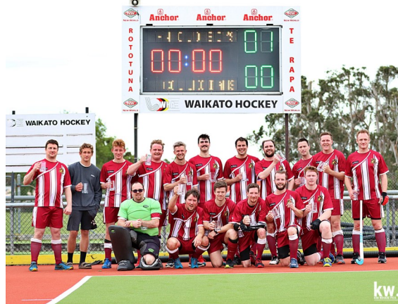
Reserve 1 Championship Round — The Helm Old Boys