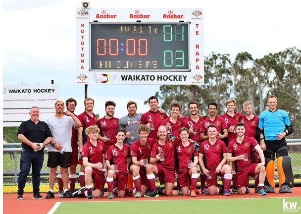
Mens Premier Championship Round — Overall — HOB Premier