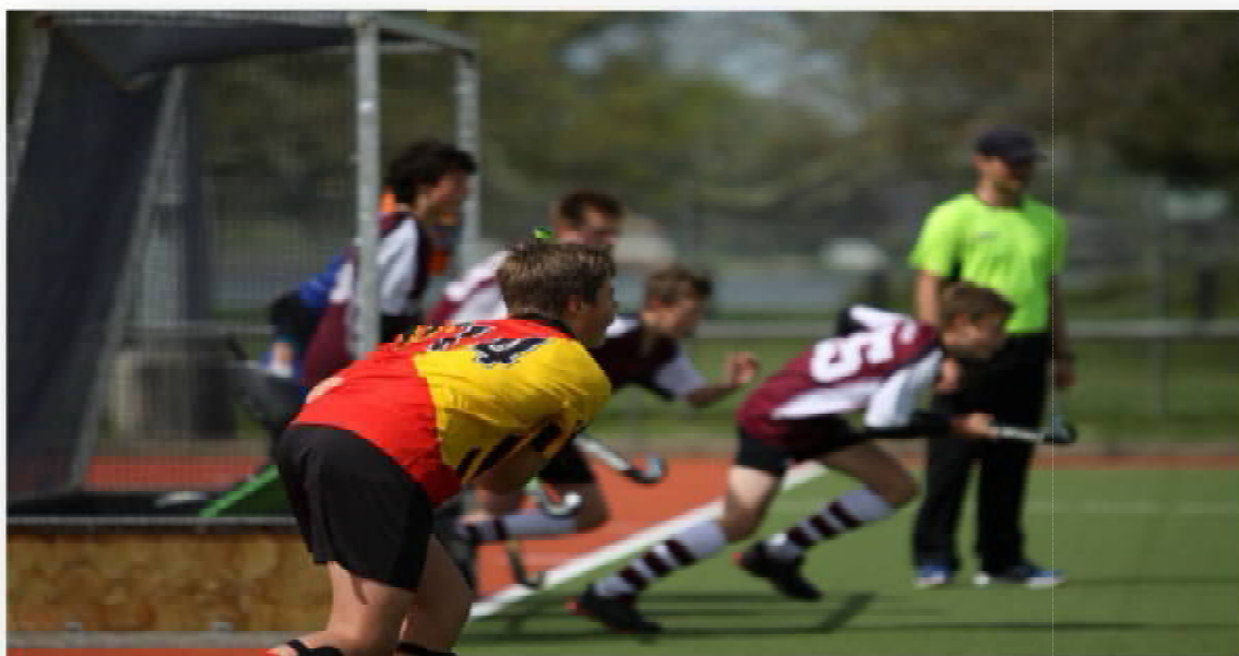
Waikato U15 B Boys vs. North Harbour at the Under 15 Championship Tournament