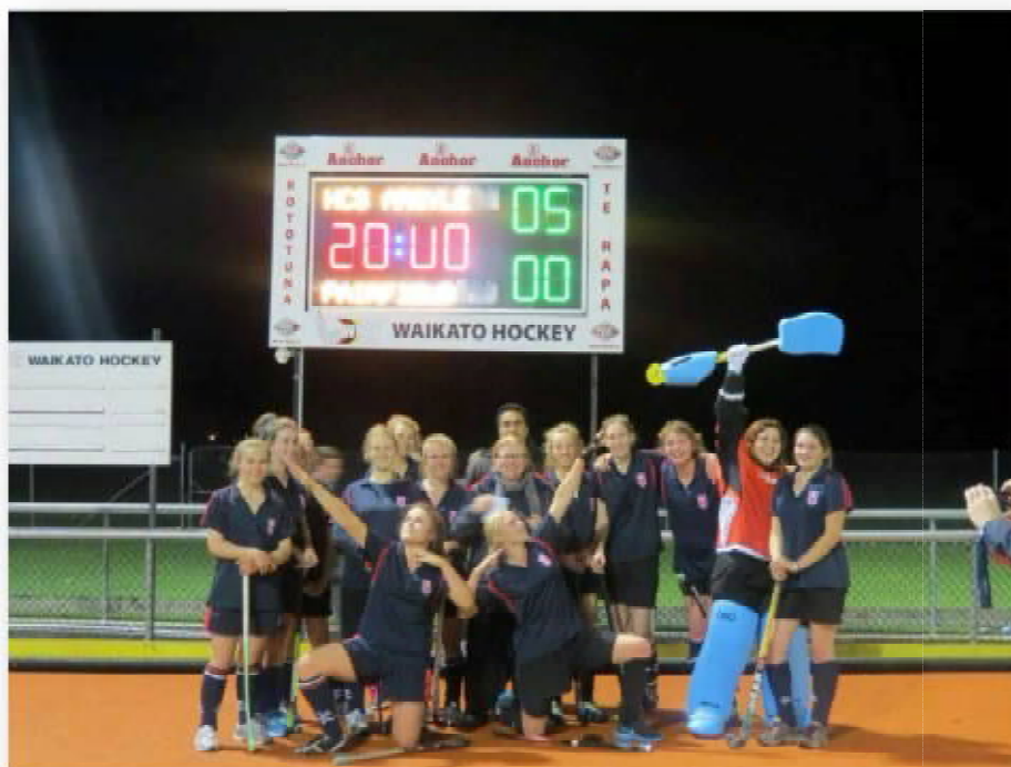
Hamilton Christian School celebrating post winning the Secondary School D Grade Div 1