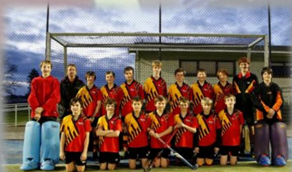
2013 Hatch Development Team