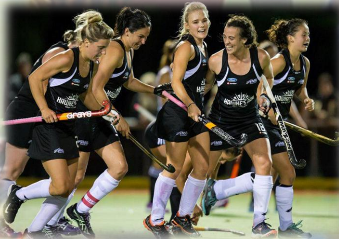
Blacksticks Women celebrating a goal in a test match held at Waikato Hockey