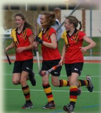
2013 Collier Trophy