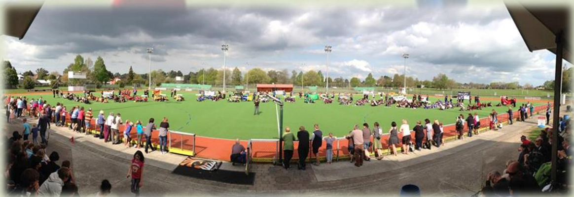
Waikato Hockey busy during 2013 Hatch Cup