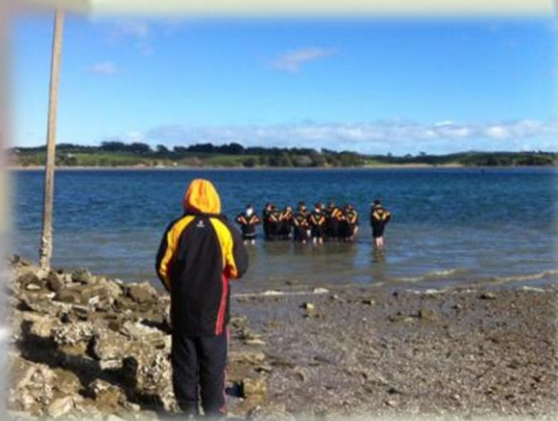
Under 18 Boys recovering at the beach post a match